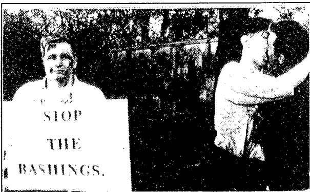
Making a powerful point with a little makeup: at the anti-violence march.

At the end of the march everyone gathered back at the Newtown Hotel for a "victory celebration"... (a piss up). It was a fabby day and everyone had a BALL.